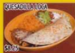
QUESADILLA LOCA $8.25 A quesadilla stuffed with fajita chicken, steak, or mixed in a 10-inch tortilla. Topped with lettuce, sour cream, guacamole, and pico de gallo. Serve with rice and beans

A T-bone steak served with two eggs fries, and toast.