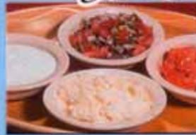
Cheese Dip $0.99