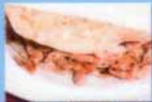
Quesadilla Grilled (beef or chicken) $3.99

AFTER ORDERING, PLEASE REMEMBER TO ALLOW US ENOUGH TIME TO PREPARE YOUR AUTHENTIC MEXICAN DISH