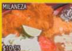
MILANEZA $10.25 Two thin breaded steak or chicken served with rice, beans, salad, and tortillas