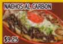
NACHOS AL CARBON $9.25 Beef, Chicken, or Mixed on a bed of chips topped with beans, lettuce, cheese Guacamole, sour cream, and a tomato.

Topped with cooked onions, bell peppers, tomatoes, rice, beans, and tortillas