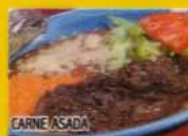
CARNE ASADA $9.99 Thin grilled steak served with rice and beans, tomatoes, onions, and avocado.